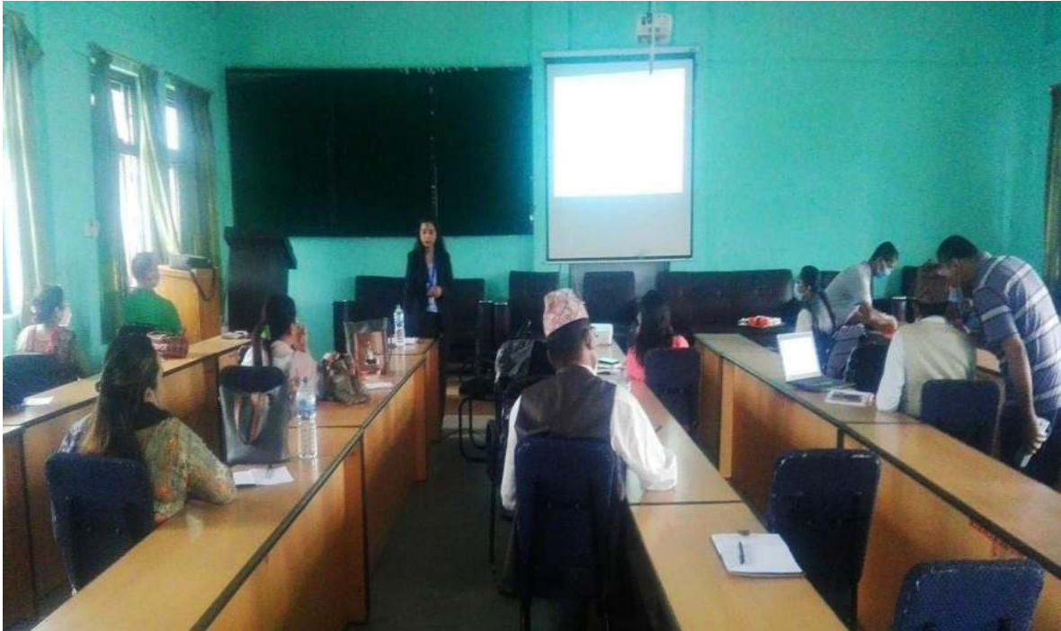
Stakeholder meeting in Syangja