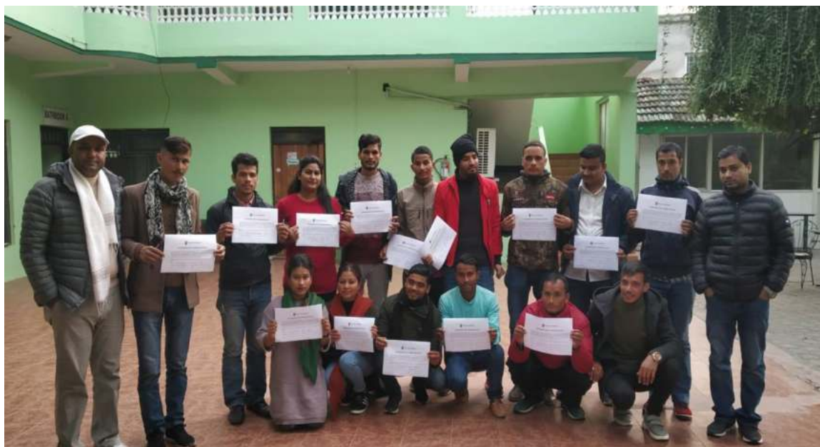
Child Safeguarding Training at Dhangadhi, Kailali