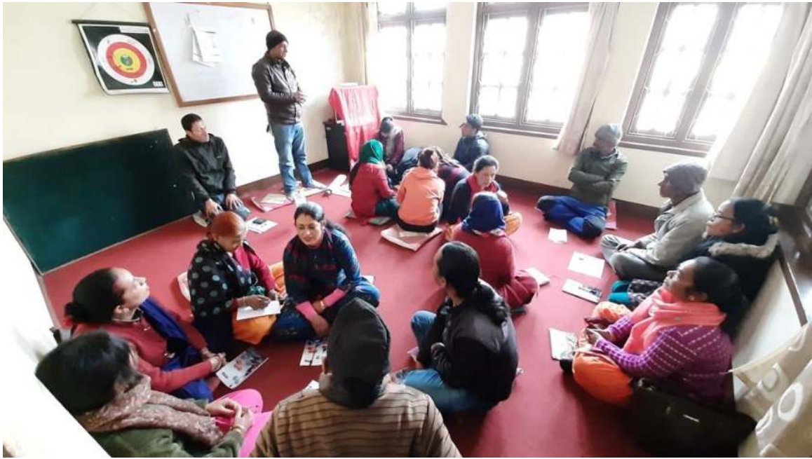
S & D Training in Kavre