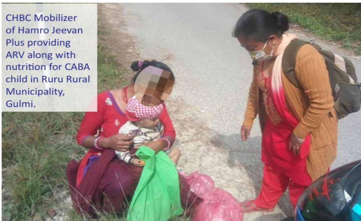
CHBC Mobilizer of Hamro Jeevan Plus providing ARV along with nutrition for CABA child in Ruru Rural Municipality, Gulmi.