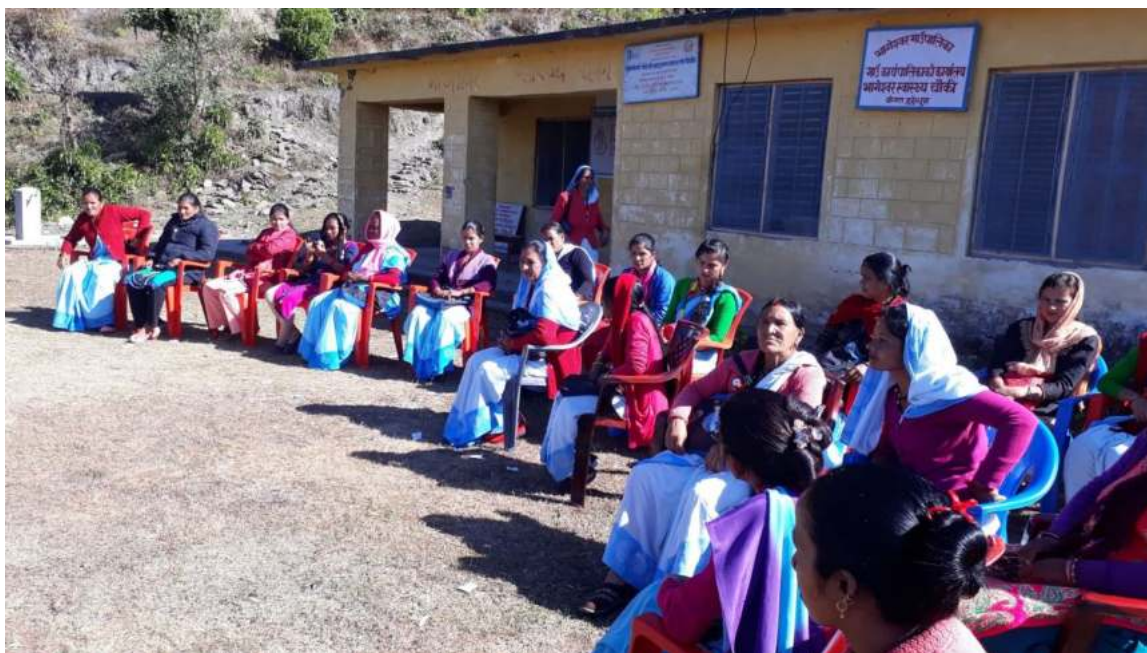
FCHV Orientation in Dadeldhura