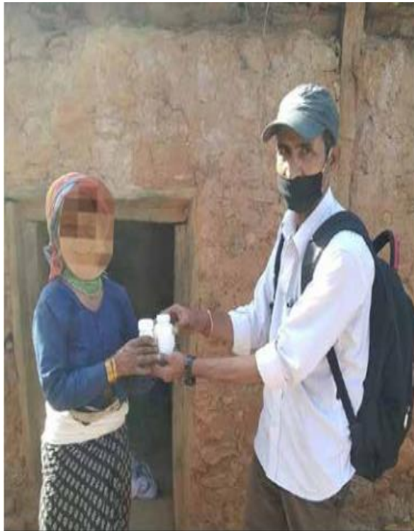
An old age woman of 65yrs. happy to get her medicines on her own door-step by CHBC Mobilizer during country LOCKDOWN. (Parshuram Municipality, Dadeldhura)