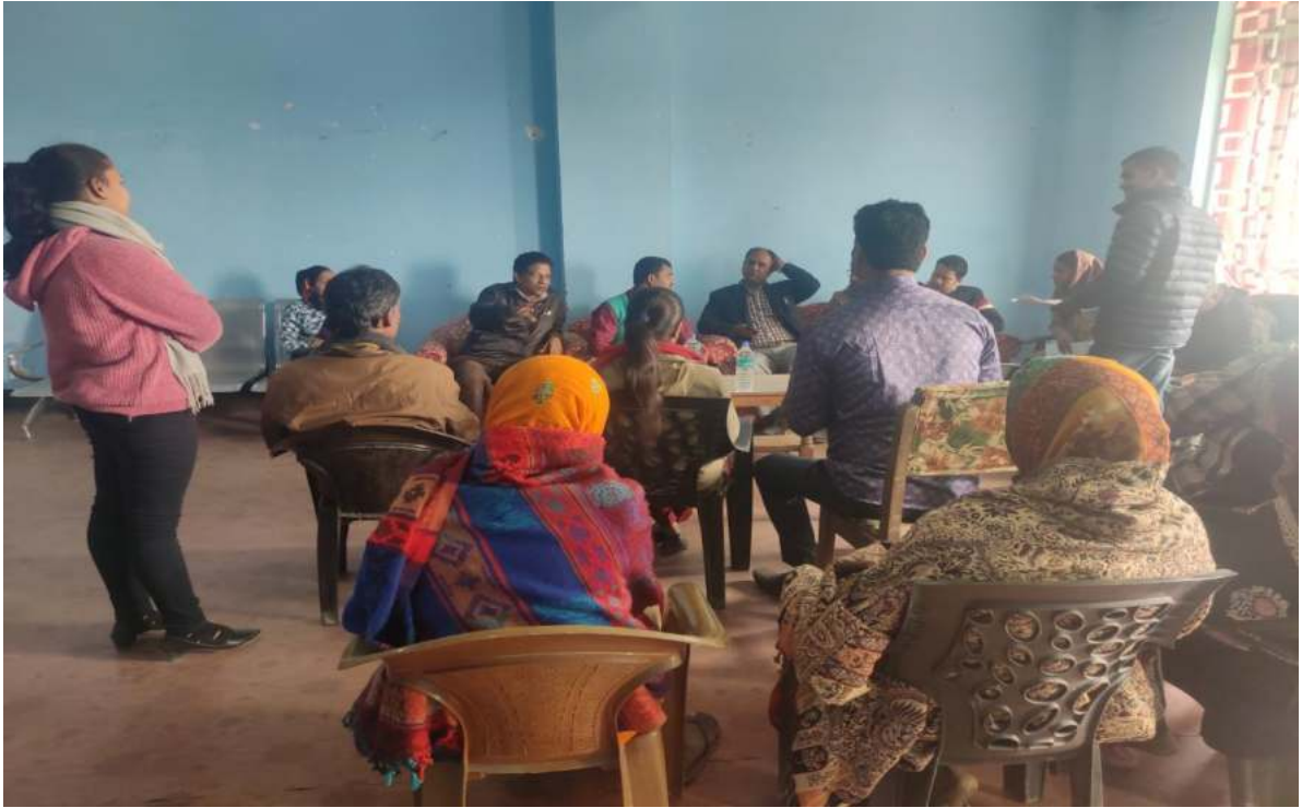
OCMC Orientation on issues of PLHIV at Gaur