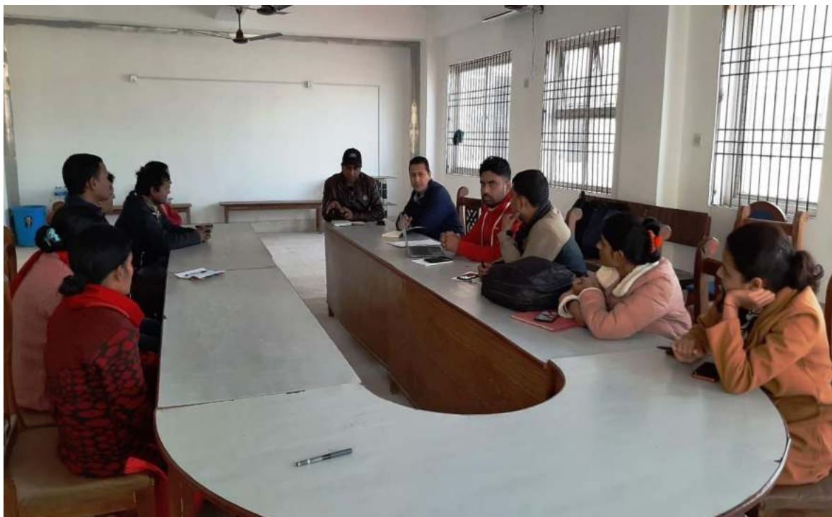
Coordination meeting at Janakpur of Province 2