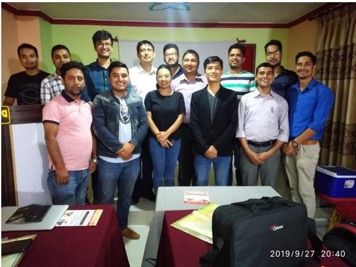
TB Review Meeting in Kailali