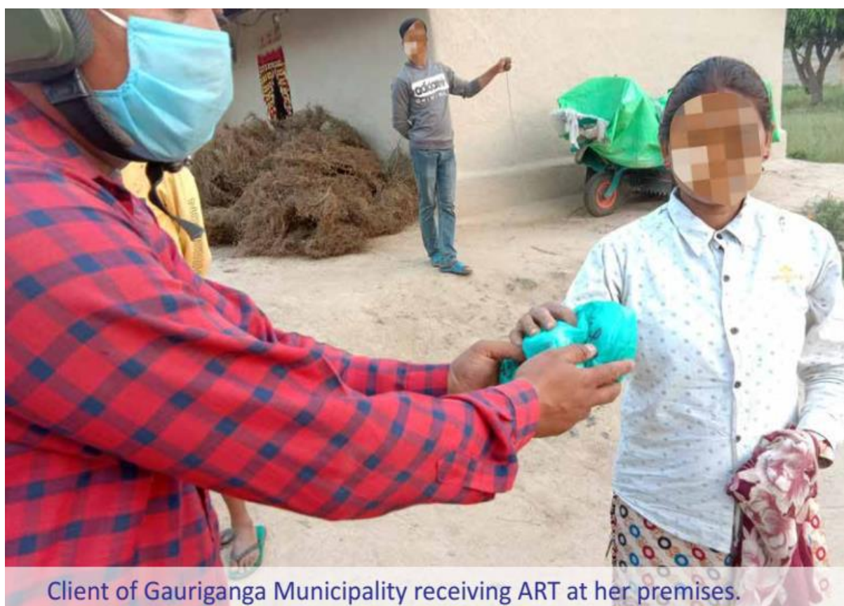
Client of Gauriganga Municipality receiving ART at her premises.