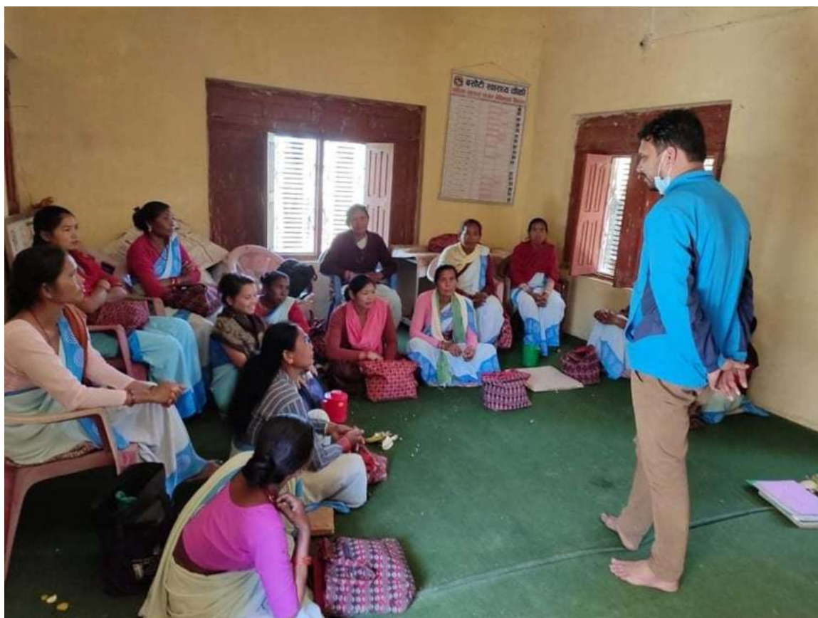
FCHV Onsite Coaching in Kailali