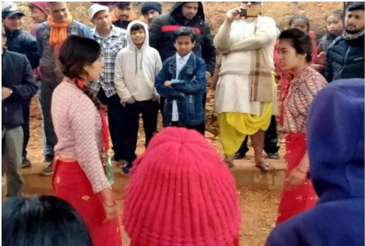
Performing Street Drama in Palpa