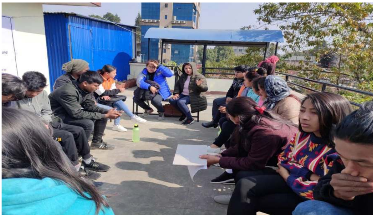
Semi-Annual Youth PLHA Meeting in NAP+N, Head Office