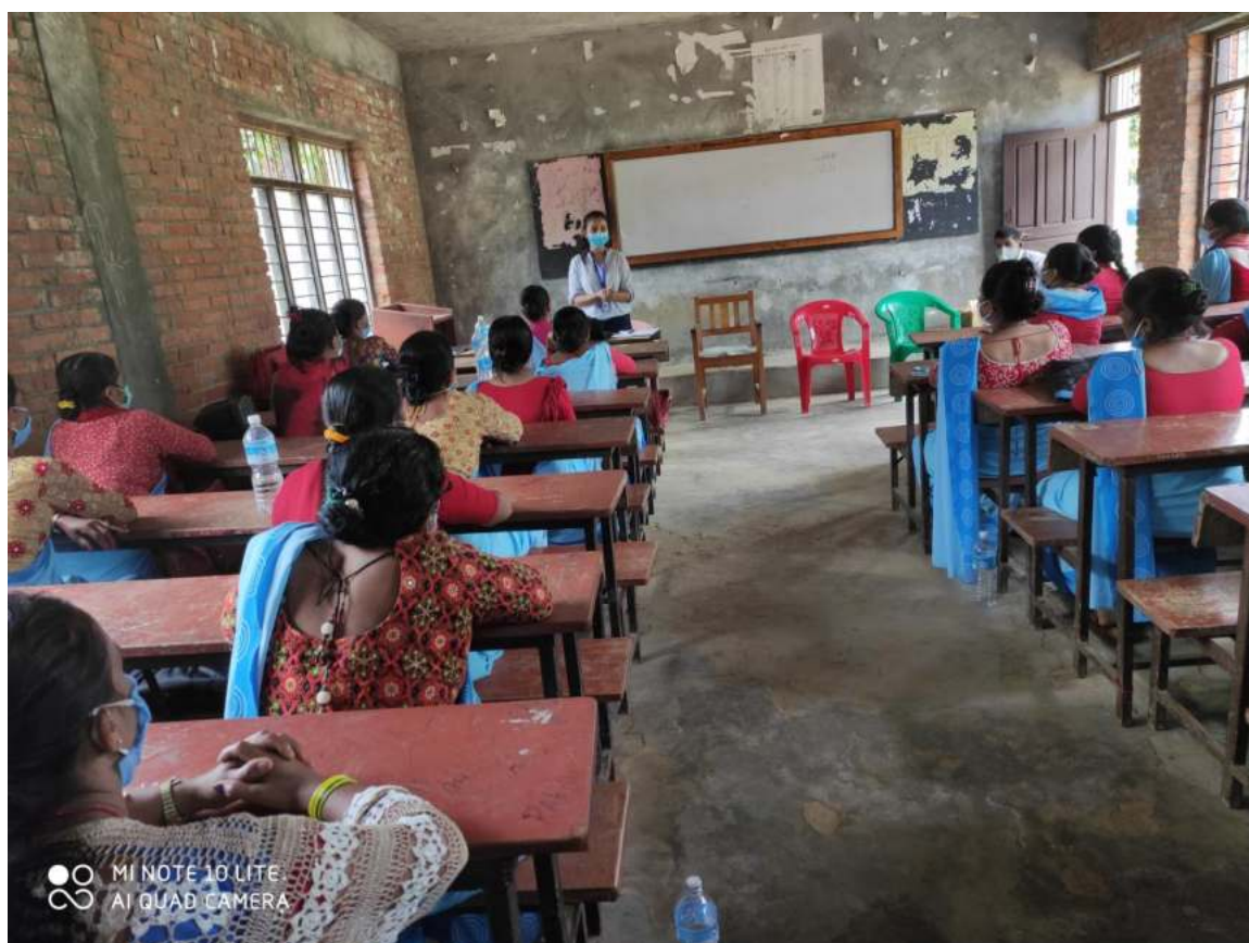
FCHV Orientation in Syangja