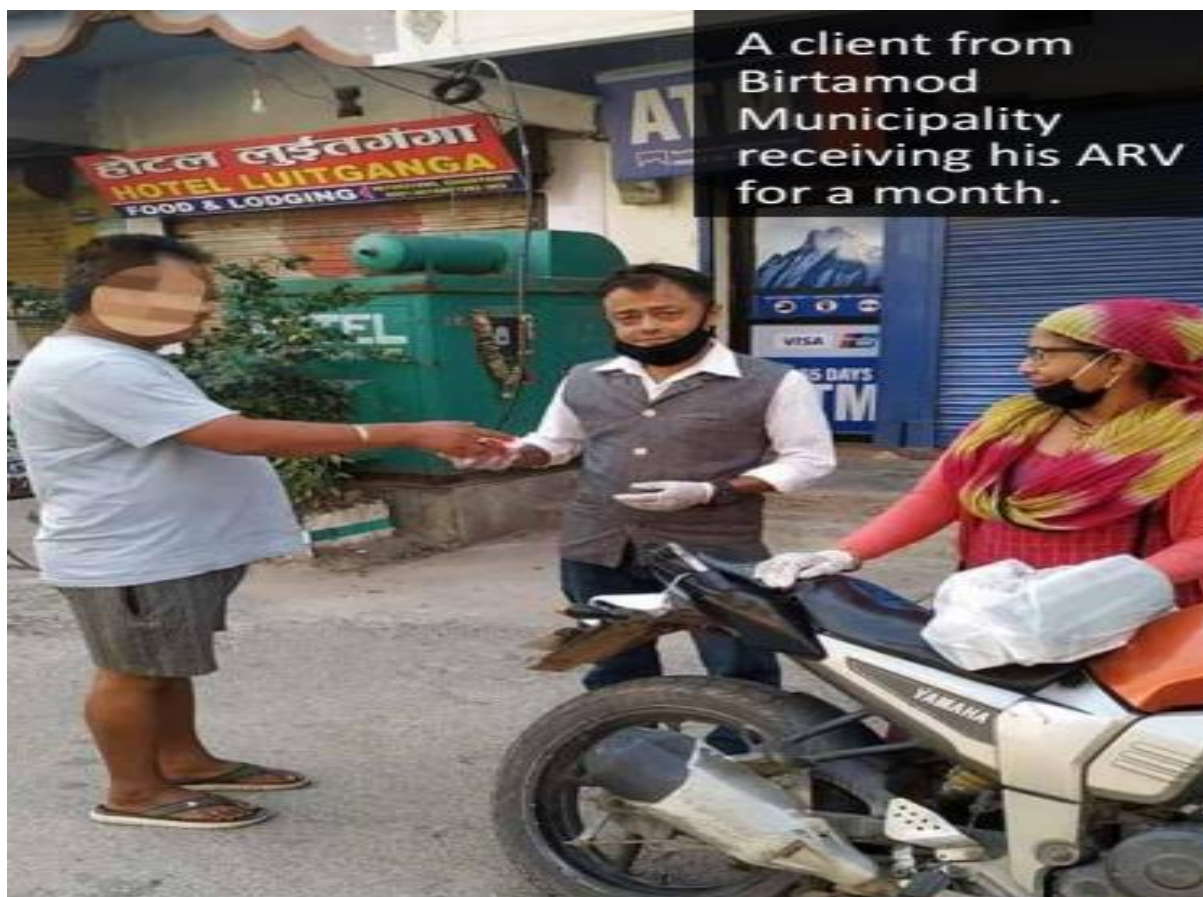
A client from Birtamod Municipality receiving his ARV for a month.