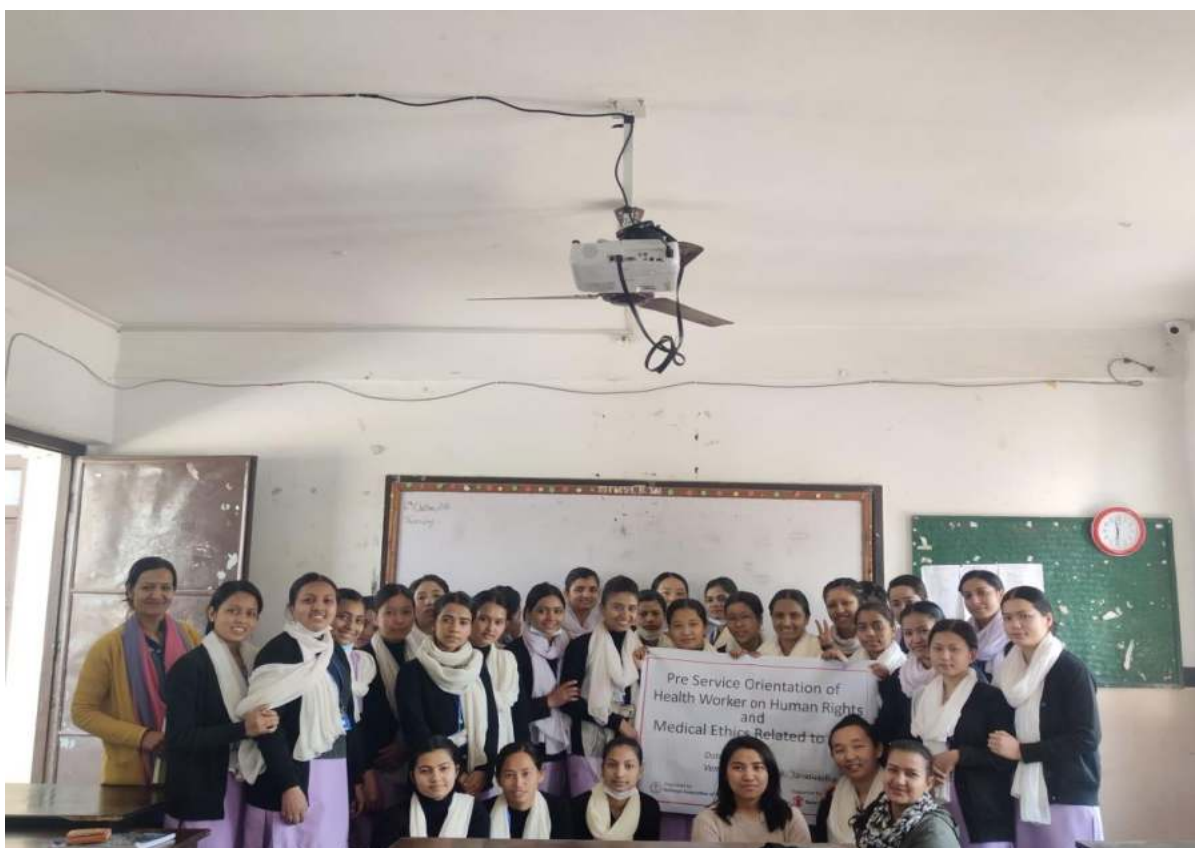
Pre service Orientation to Health Workers on Human Rights and Medical Ethics related to HIV/AIDS at Kathmandu